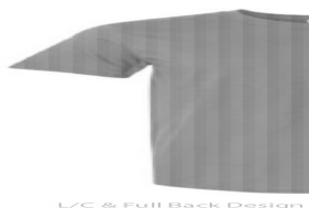
L/C & Full Back Design

Saturday, October 20, 2018, is the Montana JCF Gala at the Radisson Colonial Hotel in Helena from 5:00 PM to 10:00 PM.